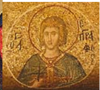
MARTYRS MENAS, HERMOGENES, AND EUGRAPHUS